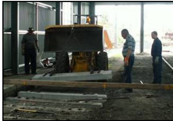
Amenities Building – The retirees group have been focused on completion of the Amenities building. Most of this work has included the the rubbing back and repainting of the external weather boards and window frames. Internally, installation and connection of the washing up sink as well as the fitting of a new hydroboil, hot water service and dishwasher have all been the latest inclusions to our shop area.