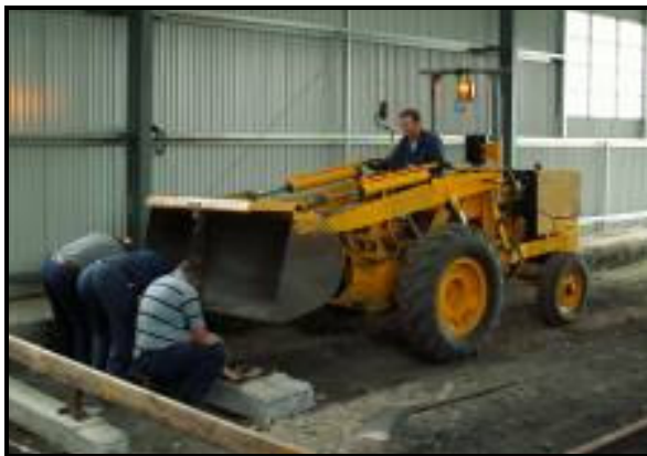
Above and Top Right: The Museum's newest (although far from new) piece of plant is put to good use in assisting with the laying of concrete sleepers inside the new Tram Shed. "Scoop" as it is more affectionately known, was obtained from Thirlmere and was in need of some major repairs before being employed in this work.

New Tram Shed – Work inside the new Tram Shed has slowed to a crawl. Since our last report work has concentrated on getting the second of the two storage roads laid. At the time of writing the second road has been laid but the long task of leveling the rails to floor level and then tamping beneath each sleeper needs to be completed. It is hoped that this process will be completed in the next few months so that the concrete slab floor can be cast.