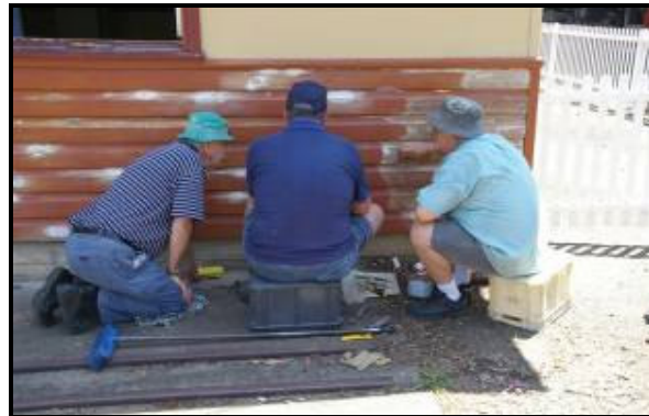
Above: Although "retired" the Museum keeps these three good looking members of the retirees groups fully employed for one week each month.