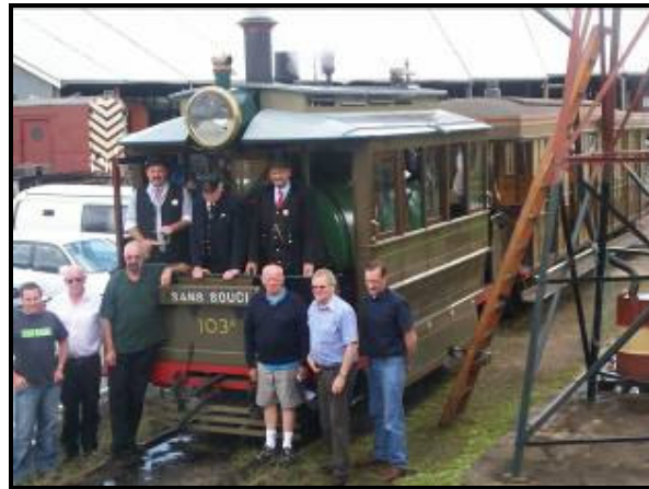
Above: Representative of COTMA and STaRPS pose in front of Steam Tram 103A and Tram Car 93B, which was steamed for the visitors on Saturday 9/2/2008.