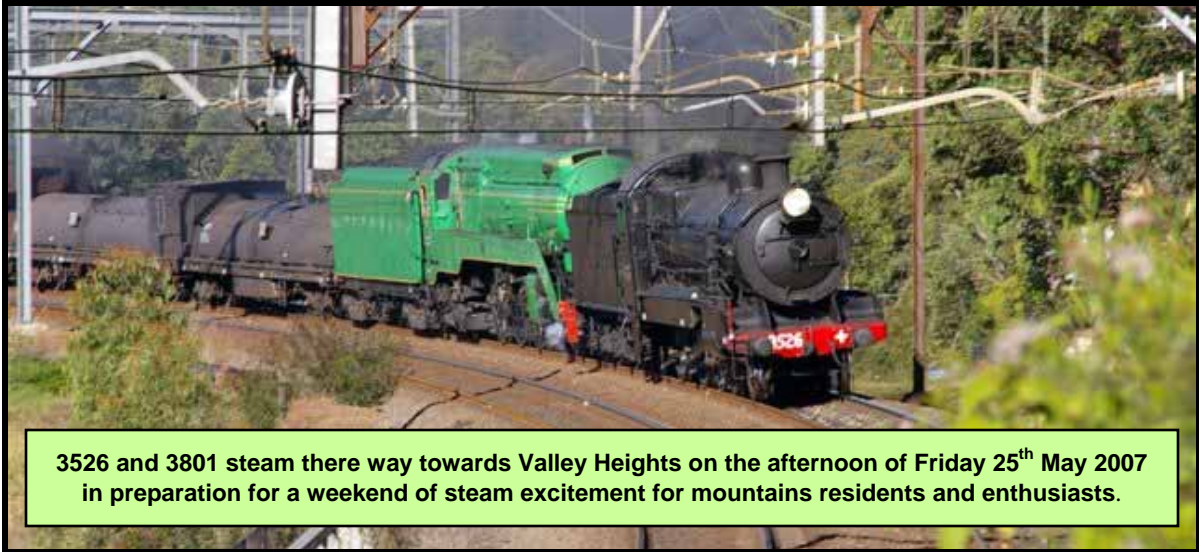
3526 and 3801 steam their way towards Valley Heights on the afternoon of Friday 25 th May 2007 in preparation for a weekend of steam excitement for mountains residents and enthusiasts.