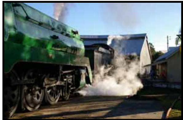
Above Left: 3526 and 3801 shunt the Water gins and VHO Van into the Departure Road. Above Right: 3526 stands on the turntable while 3801 is coaled before both were serviced over the Ash Pit.