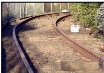
Right: Re-railing of the Coal Stage Siding nears completion with the rails spiked to every second sleeper. The condition of this siding is a vast improvement.