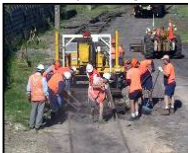
Left: The RailCorp work crew assisted by some Museum members commence work to lift the first of the two Ash Sidings.