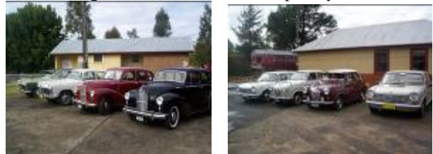
Above: Austins on display on Sunday 16 July 2006.

The Museum hosted a visit by members of the Austin Motor Vehicle Car Club on Sunday 16 th July 2006. Members with 15 cars displayed their vehicles in the Museum for the benefit of the visiting public. Club members were also escorted around the Museum on guided tours. Following the visit a very complimentary letter was received from the Car club expressing how much their Member's enjoyed the visit and thanking the Museum for their hospitality.