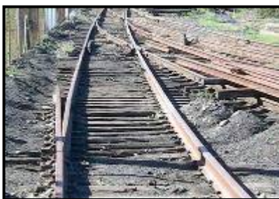
Left: The catch point in the Coal Stage Siding finally realigned after work saw sleepers and rail replaced. The points which were reconstructed by Job Quest participants can be

Now that the Job Quest program has completed we have been left to finalise the work that remains incomplete. While the majority of the heavy work on the points was completed, the sleeper and rail replacement work on the Coal Stage Siding did not get finalised and the work of repinning the rails to the sleepers has had to be completed by our own members. This work has now been completed, and all that remains to be done is the realignment of the final 20 metres of the siding, which will involve dragging the siding away from the Museum's boundary fence adjacent to the main railway line to allow greater clearance.