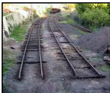
Left: Job completed and the rails and sleepers (or lack there of) are clearly visible.

Fire Risk Hazard Reduction – With the onslaught of summer comes the ever increasing risk of fire. Working Bees are being held with the view of removing excess combustible material particularly from the garden between the Coal Stage Siding and the Departure Road to prevent to minimise and prevent an outbreak of a fire and the potential damage that a fire may cause.