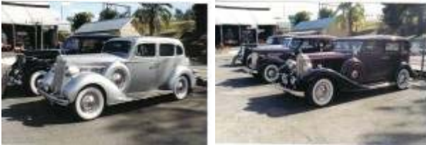
Above: Packards on Display on Sunday May 2006.

The Museum hosted a visit from a small band of members of the Packard Car Club on Sunday 7 th May 2006. Packards were regarded as the US equivalent of the Rolls Royce. Unfortunately, other commitments in Cooma resulted in a smaller than usual attendance by members of the Car Club but we were fortunate enough to be graced with four examples on the day. On Sunday 18 th June 2006, members of the Singer Car Club came to the Museum for the day and on Sunday 16 th July 2006 we are expecting a large contingent (possibly up to 15 Cars) of members from the Austin Car Club. Be sure to mark that day into your calendar to visit the Museum if you have not been before.