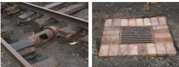
Top: The Ash Siding Points are in no fit state to accept regular traffic once the Tram shed is built. Bottom Left: Work on the Departure Road points has revealed the old water main that ran from the depot to the Water Columns in the station yard. Bottom Right: New brickwork around drains.