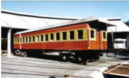
(Photo: CBI 1073 painted externally sits on temporary bogies now awaits internal attention.).

This carriage is representative of those used on suburban trains prior to electrification. Built by Clyde Engineering Company, (previously Hudson Brothers) as BB 1073 this car entered service for the NSWGR on 2 nd August 1902. Rebuilt in 1936, the car was converted to a 1 st class Tourist Car by the addition of toilets. Again in 1970 the carriage was converted to a composite car and re-numbered CBI 1073. Withdrawn from service in 1974, to be burnt, the carriage was reprieved and used as an amenity van at the Apprentice Training College at Chullora before being sold to a private buyer at Minore (near Dubbo) NSW in 1975. It has been purchased by STaRPS to replace the end platform car that was lost in the Parramatta Park fire in June 1993. The car body arrived by road at Valley Heights on 13 th February 1998 and was placed on temporary bogies. It is graciously chosen for a Federal Government Centenary of Federation Grant in 2001 with which extensive body rebuilding and partial exterior repainting was undertaken. That work continues, but now financed from Society limited resources.