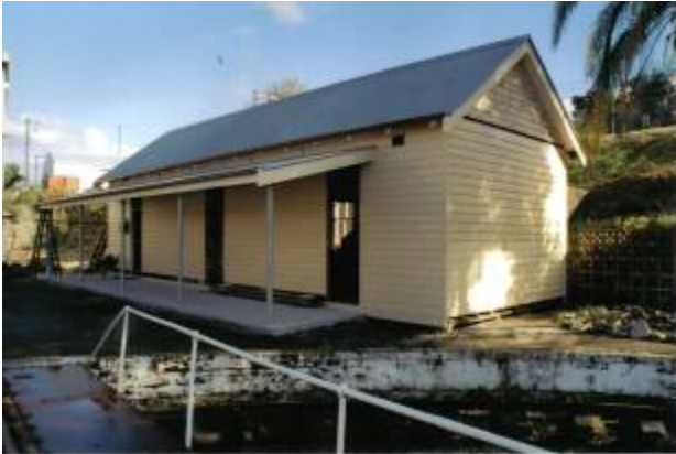
Eastern Wall with new weatherboard timbers installed on the wall. The gable is still awaiting new weatherboards timbers. Both photos courtesy of Dave Torr.