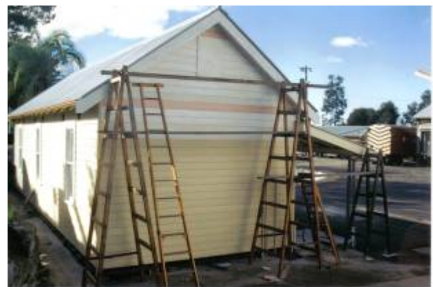
Western wall with new weatherboard timbers installed. The louvre vent is still to be installed in the gable roof.

Work has now commenced on the repair of the interior of the building, and that will be the subject of another report on this building, but that will be some time away.