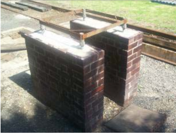
The completed brick pedestal that will support the Museum’s Water Column. Jan 2006

Water Column – For some time now, member Ken Rudd has been slowly restoring the various components of the Museum’s Water Column. While the majority of these components have been de-scaled, repaired, treated with appropriate primer and paint, the main column component is still in the process of being treated. Leading up to the 150 th Celebrations it was hoped to have the main column mounted on its brick pedestal foundation, but circumstances prevented this from occurring. Thanks to Nick Hill, the brick pedestals were completed during the celebrations and they are now ready to support the main column once restored.