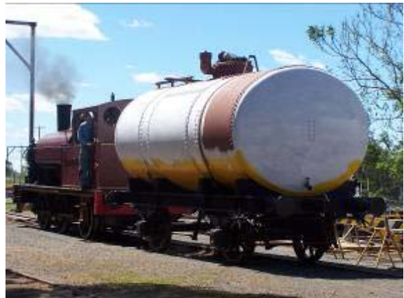
Two views of Stepho hauling the Shell Oil Tanker during the brake testing on Sunday 18/12/05 – Photos: Ross Stenning.