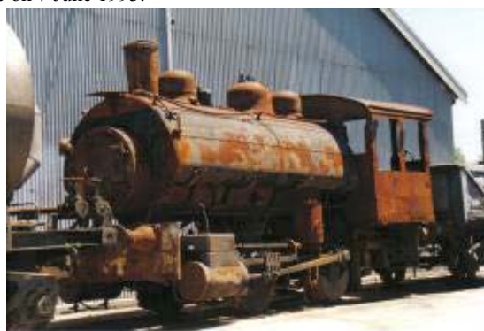
The charred remains of 1022 showing the scars following the June 1993 Parramatta Park Fire. This locomotive is now the subject of a long term restoration program by members of STaRPS.

An engine identical to 1022 and 1023 was purchased by Emu Gravel Company a year earlier and became their No: 1. This engine came into the possession of Parramatta Park Steam Tramway and 1022 was given to NSW Rail Transport Museum. However as 1022 would only have been a static exhibit at the RTM and it was in operational condition it was agreed that the two societies exchange engines, the changeover occurring on 20th October 1970. 1022 saw active service until damaged by fire on 7 June 1993.