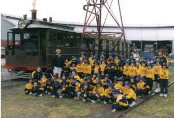
Students from Blue Mountains Grammar Preparatory School – Valley Heights gather beside Steam Tram 103A on Friday 16 September 2005.

Our second School excursion occurred on Friday 16 th September 2005 when approximately 60 Students and staff from the Blue Mountains Grammar School Preparatory Campus visited the Museum. The students ranged in age from 4-10 and were shown around the Museum which was in the final stages of being prepared for the 150 th Anniversary Event. The highlight for the students and staff was the opportunity to be the first fare paying passengers to ride behind the Steam Tram following its restoration. Only earlier in the morning on the day of the visit was the Steam Tram and Trailer accredited for service by the Transport regulator.